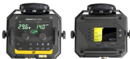
Remote User Interface