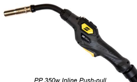
PP 350w Inline Push-pull