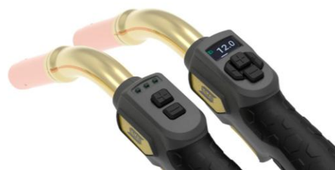
Exeor MIG 4.0W 2 CX and 4.0W 2 DX Torches